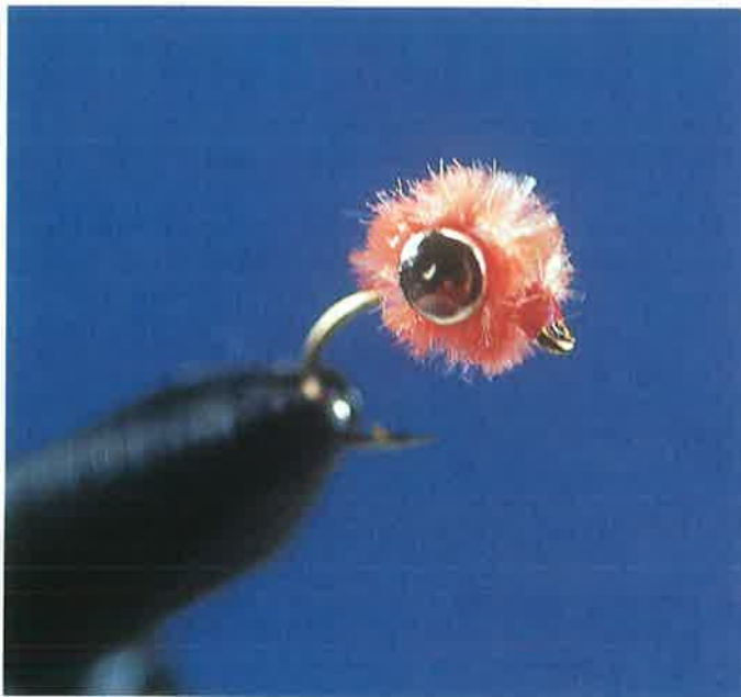
The Eggo Fly

Every fall, millions of salmon lay billions of eggs, creating a feeding frenzy trout and steelhead can't resist. Eggs are found on the bottom and because the Eggo Fly incorporates lead eyes heavy enough to keep it on the bottom, it's a real winner.