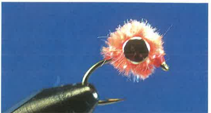
Figure-eight the chenille around the eyes to form the egg, then tie off the chenille. The fly is finished.