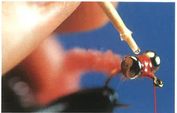
Tie in the eyes with figure eights of thread and coat with super glue.