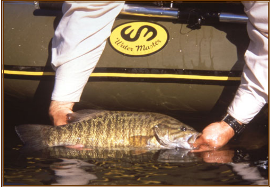
Bronzeback smallmouth bass from the Columbia River